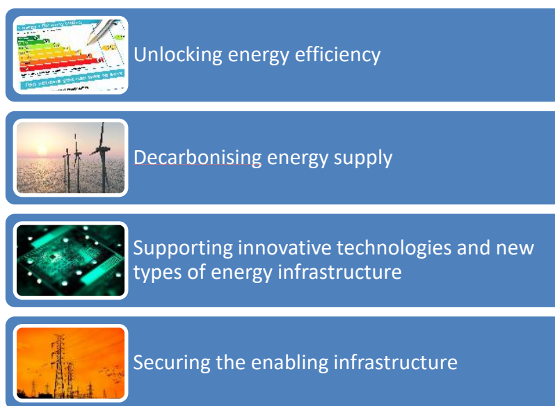
Figure 1: Themes of the energy lending policy